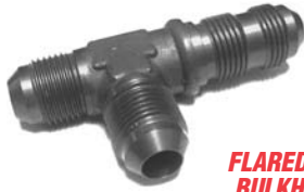
AN804 TEE, FLARED TUBE WITH BULKHEAD ON RUN