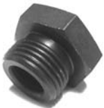
AN814 PLUG AND BLEEDER, SCREW THREAD