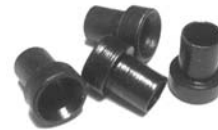
AN819 (MS20819) SLEEVE, COUPLING