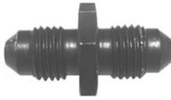
AN815 UNION, FLARED TUBE