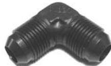
AN821 ELBOW, FLARED TUBE, 90°