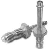
AN807 ADAPTER HOSE TO UNIVERSAL