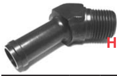
AN844 HOSE ELBOW, PIPE THREAD, 45°