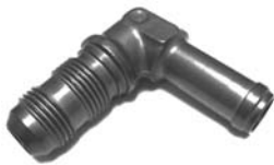
AN838 ELBOW, BULKHEAD & HOSE TO UNIVERSAL, 90°