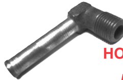
AN842 HOSE ELBOW, PIPE THREAD, 90°