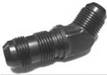
AN837 ELBOW, FLARED TUBE, BULKHEAD AND UNIVERSAL 45°