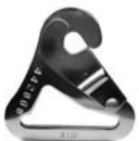
TRIANGULAR END FITTING P/N 13-04101 . Ea.