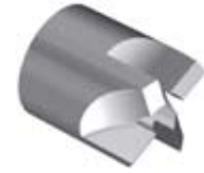
AT402 Series (100°)