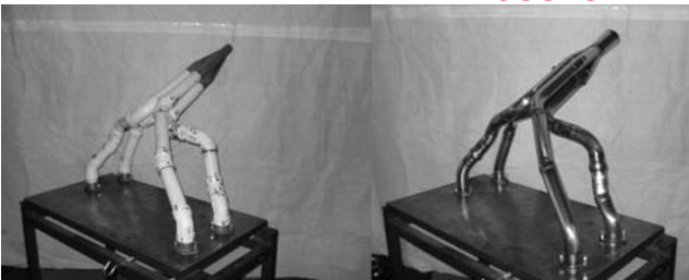
Finished PVC Mock Up