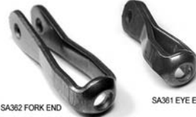
SA361 EYE END & SA362 FORK END