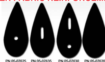
PN 05-07625 PN 05-07635 PN 05-07630 PN 05-07620