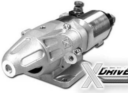
Only 7.6 lbs. Lightest Starter Available

The X-Drive starter is newest in the light weight, high torque starter lineup from Kelly Aerospace. Targeted toward users that want one of the industries lightest but most powerful starter on the market, the X-Drive delivers the same high torque, low current draw, and superior duty cycle that had previously been available only to E-Drive customers. X-drive uses No Bendix, the same powerful permanent magnet motor as the E-drive, and is the lightest starter available. The X-Drive starter is FAA/PMA'd and allows Kelly Aerospace to service virtually all OEM/aftermarket Lycoming applications. Spin Better, not faster!