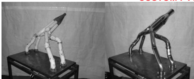
Finished PVC Mock Up