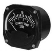
EGT - CHT GAUGES 3-1/8" Square EGT P/N 3A2-1 ..... 3-1/8" Round EGT. P/N 3C2-1 ..... Square CHT ..... P/N 3A1 ..... 3-1/8" Round CHT. P/N 3C1 .....