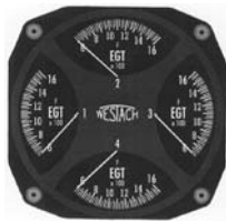
QUAD EGT. P/N 3AQ2...