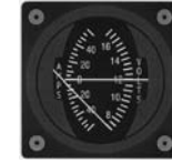
DUAL VOLT-AMMETER 6-16V/0-30 A P/N K2DA10-21 ..... 6-16KV/0-60 amp P/N K2DA10-18..... Complete with Shunt