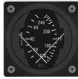
DUAL OIL PRESSURE OIL TEMPERATURE 0-80 PSI/100-260°F P/N2DA3MM .