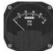
RECORDING TACHOMETER 3-1/8" size Runs directly off magneto. 12V power required to run Hour Meter 0-3500 RPM ... P/N Y3AT32..... 0-5000 RPM ... P/N Y3AT5-2.....