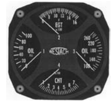
QUAD COMBO CHT/EGT OIL PRESS/OIL TEMP P/N 3AQ4MM...