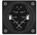
DUAL FUEL LEVEL Uses capacitance type senders. 5V output. P/N 2DA4V .