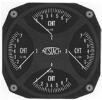
QUAD CHT P/N 3AQ1...

Four electric instruments in one standard size 3-1/8" aircraft case. Weight - only 6 oz. Guaranteed for accuracy within 2%. 1 year warranty. Get four "like" readings or four different ones. Order Senders below except for pressure instruments.