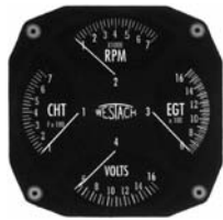
QUAD COMBO TACH/ EGT VOLTS/CHT P/N 3AQ7-3...