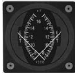
DUAL EGT 700-1700°F P/N 2DA2 .