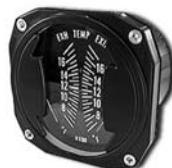
COMBINATION EGT & CHT 3-1/8" size, Wt.10oz., 700-1700°F/ 100-800°F. P/N 3DA1...