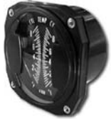
TWIN CHT 3-1/8" Size; Wt. 10 Oz., 100-800°F P/N 3DA8....