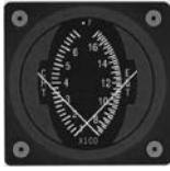
DUAL EGT-CHT 700-1700°F EGT 100-700°F CHT P/N 2DA1 .

All pressure instruments come complete w/pressure senders only (matched to instrument). On all other instruments, order senders at bottom of page.