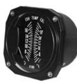
TWIN EGT 3-1/8" Size; Wt. 10 Oz. 700-1700°F P/N 3DA2....