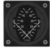
DUAL TACHOMETER 0-5000 RPM P/N 2DA5-2 .