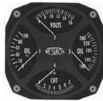
QUAD COMBO VOLTS/CHT OIL PRESS/OIL TEMP & OIL Press. Sender Only P/N 3AQ5MM.....