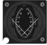
DUAL CHT 100-700°F P/N 2DA8 .